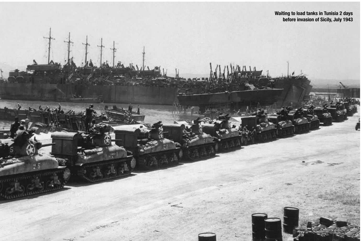
Waiting to load tanks in Tunisia 2 days before invasion of Sicily, July 1943