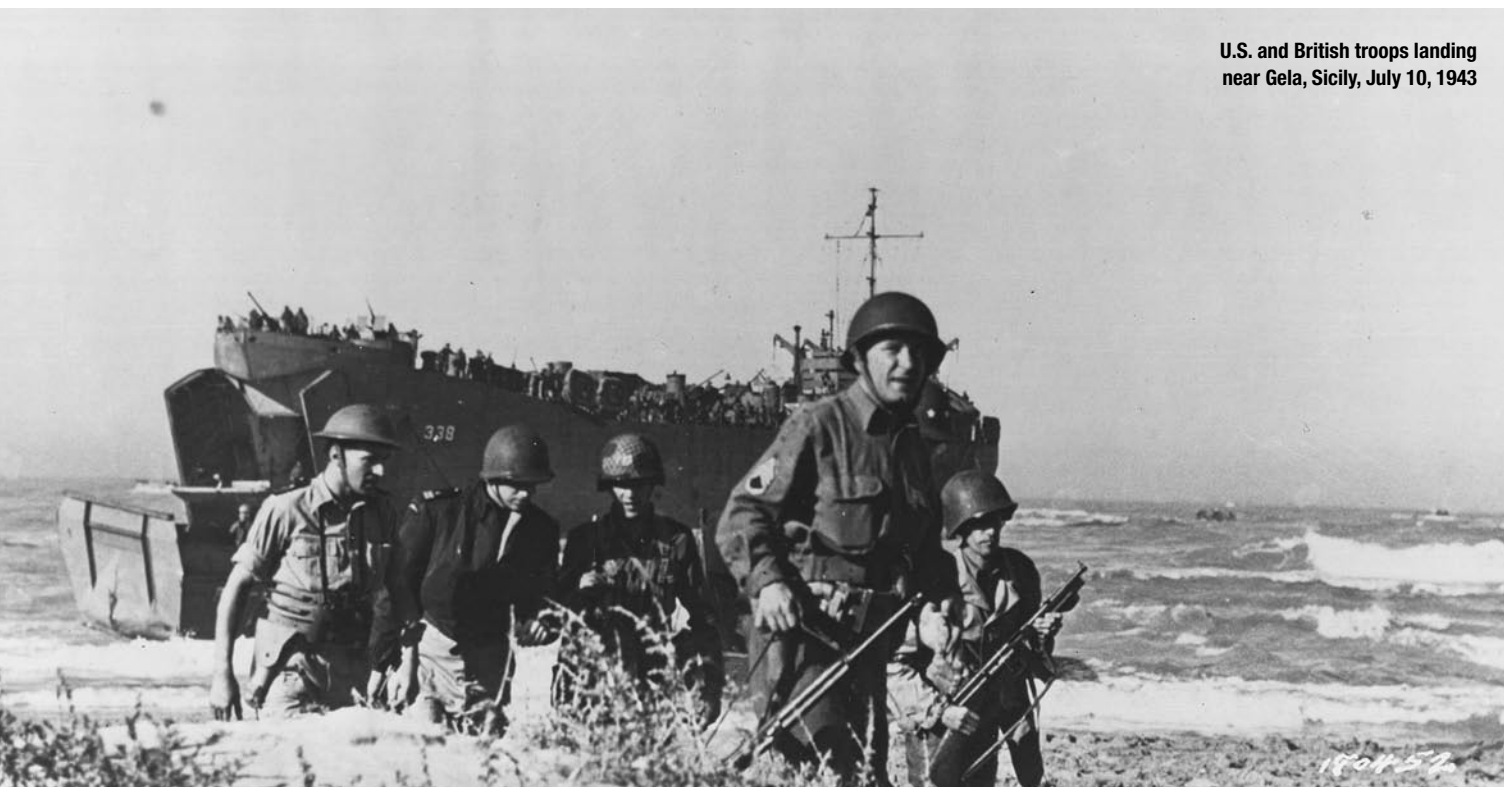
U.S. and British troops landing near Gela, Sicily, July 10, 1943