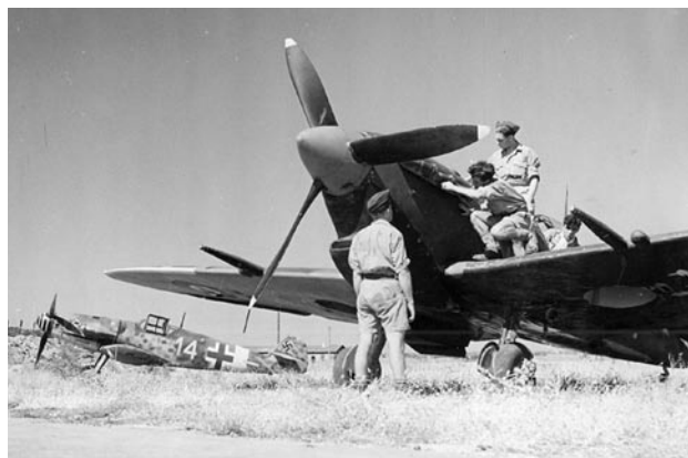
Royal Air Force crew services British Spitfire on captured Sicilian airfield

The NAAF objectives for Corkscrew were to destroy any possibility of air interference from the island, blockade