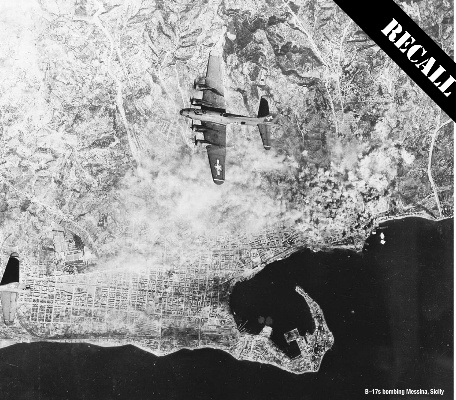
B-17s bombing Messina, Sicily